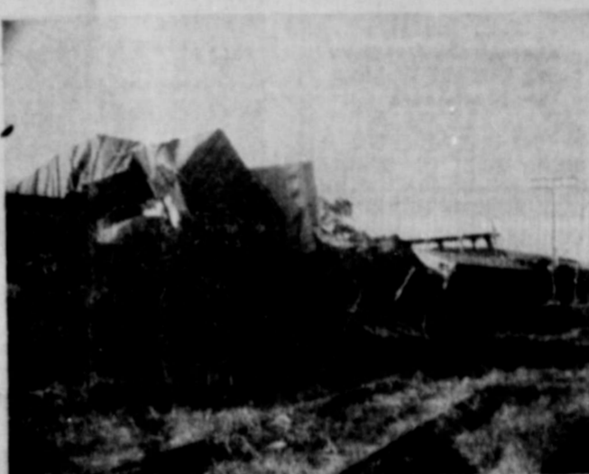
SHOWN ABOVE is the results of an early morning train wreck in Ranger. The Texas-Pacific freight was derailed due to a broken axle Wednesday morning. No