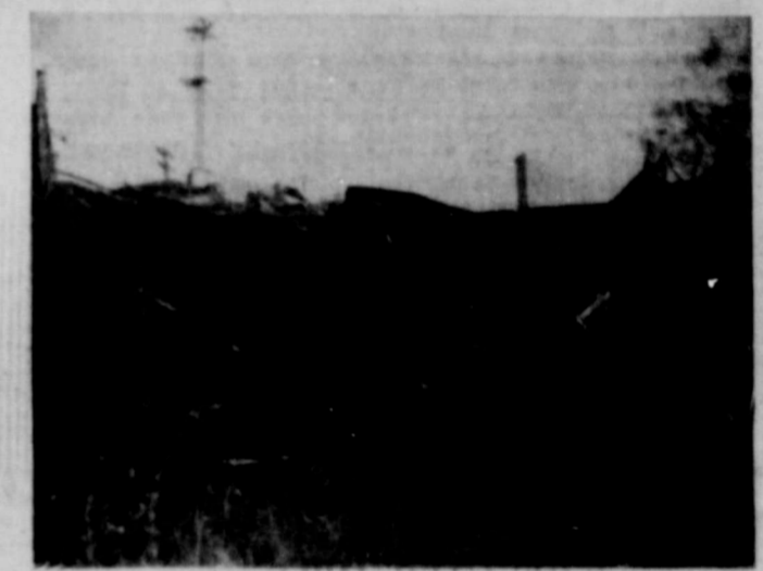
one was injured in the accident. Twenty-eight of the ninety-six cars on the track were derailed.