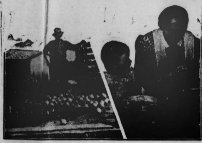
Vitamin-rich citrus fruits, like the grapefruit on the left, are among the $9,000,000 worth of body-building foods moved each month through the Food Stamp Program of the U. S. Department of Agriculture to nearly four million members of families eligible to receive public aid.