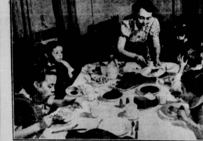
The U. S. Department of Agriculture's Food Stamp Program each month helps build the home nutrition front by moving about $9,000,000 worth of farm products to nearly four million members of public-aid families, like these hungry youngsters.