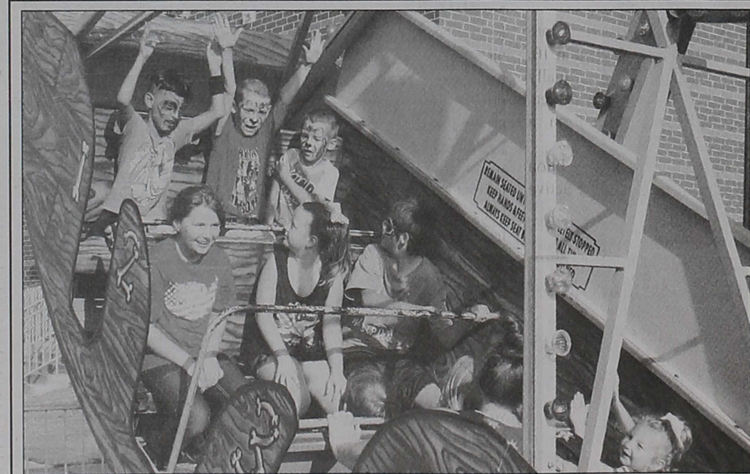
The annual Celebrate Freedom conducted Friday, June 30, at Royse City High School started off with a bang at 6 p.m. as this group of kids rode the Pirates Revenge ride. There were rides and inflatables for the children, live music presented throughout the evening by three different bands and foods cooked on site by vendors. Those attending bought blankets and lawn chairs to enjoy the evening. Fireworks began at 9:30 p.m.

NOTICE: While most advertisers are reputable, we cannot guarantee products or services advertised. We urge readers to use caution and when in doubt contact the Texas Attorney General at 1-800-621-0508 or the Federal Trade Commission at 1-877-FTC-HELP. The FTC web site is www.ftc.gov/bizop