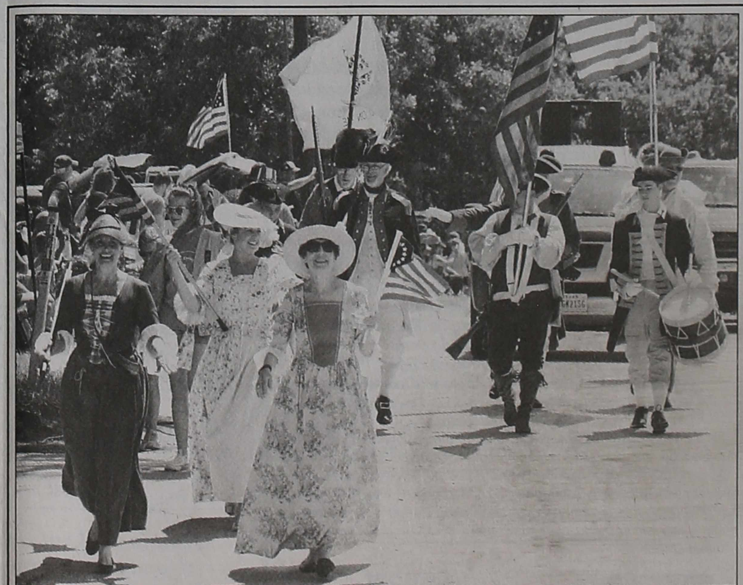
Members of the Daughters and Sons of the American Revolution boldly march onward, Tuesday, July 4, 2017, at the intersection of Boydston and Clark Streets, during the Rockwall Independence Day parade, Photo by Tim Burnett/Rockwall County News