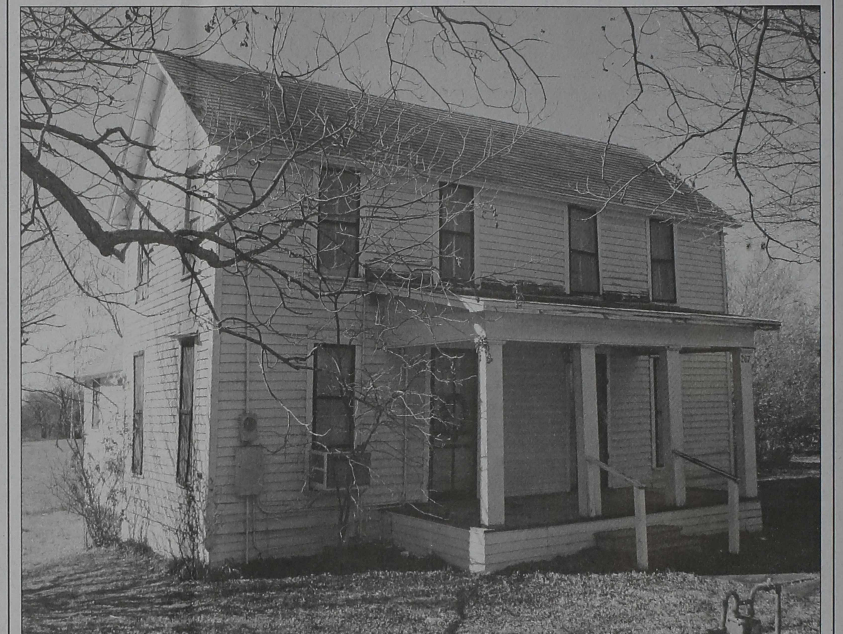
The oldest house in Royse City, located in the 100 block of North Houston, is scheduled to go up for sale. The house, pictured above, was built in 1882.