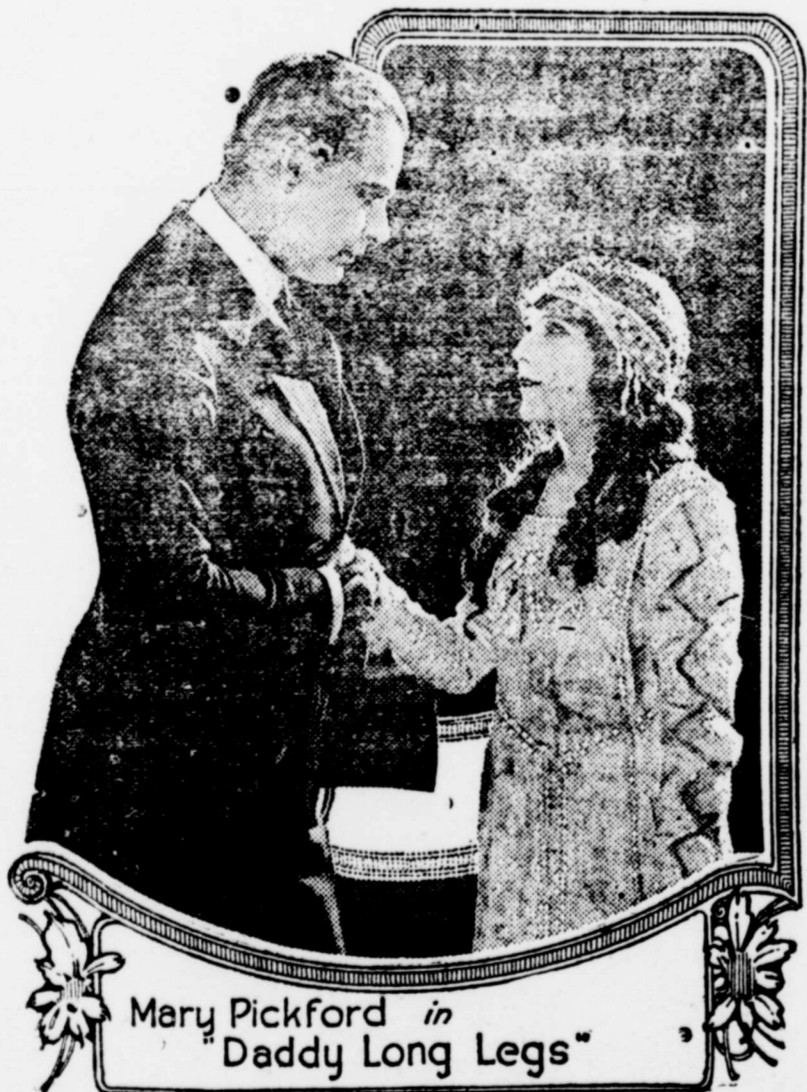
Mary Pickford in "Daddy Long Legs"

Marshall Neilan, "The Mark Twain of the screen," who directed "Daddy Long Legs," Mary Pickford's newest and greatest picture, has a part in the film which will be shown at the Star Theater on the night of January 1st. Audiences which are much more familiar with the faces of great actors than of great producers will have a chance to judge Mr. Neilan as an actor. He has a part of a young col-