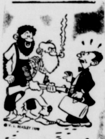
Don't Blast Him, Granpaw, Hit's That Nice Insurance Man From