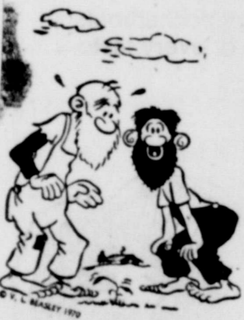
Reckon Granpaw' Shoulda Insured His Crops With