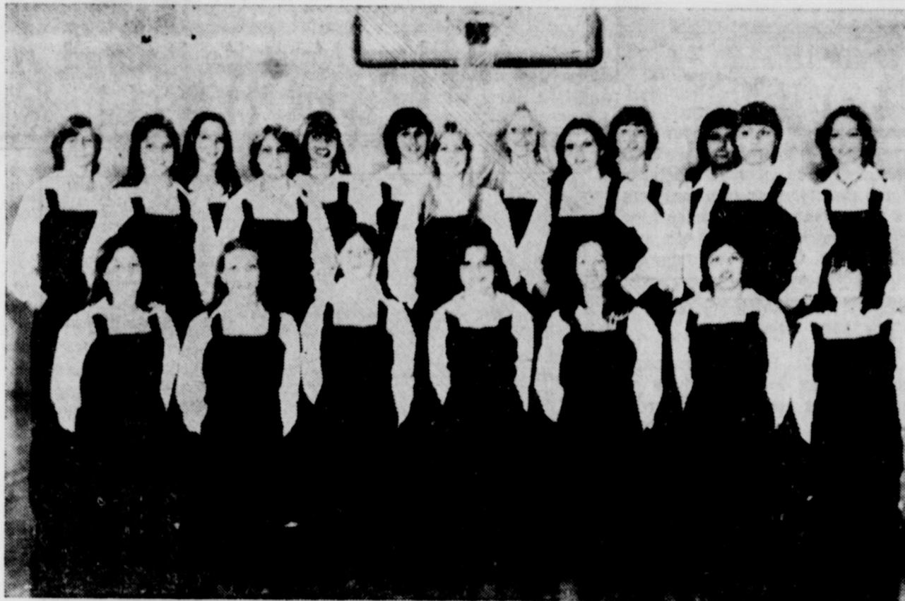
1976 DISTRICT 25-B CHAMPIONS