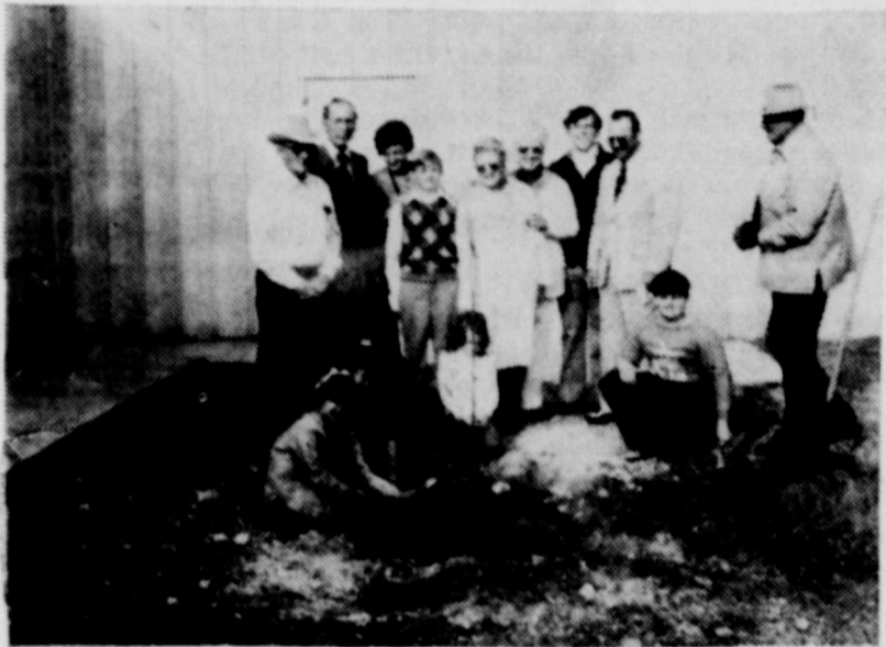
Children spooning dirt around the "Liberty" tree as those who were on the Dedication program look

Any reflection on the character or standing of any person, firm or corporation is not intended and will be corrected upon notification.