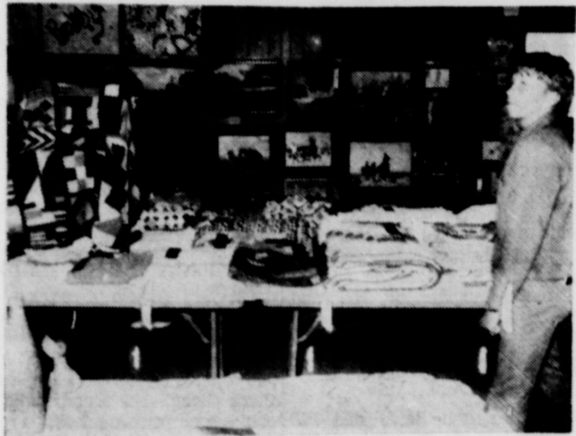
Even the Kids Like to Go to the Fair