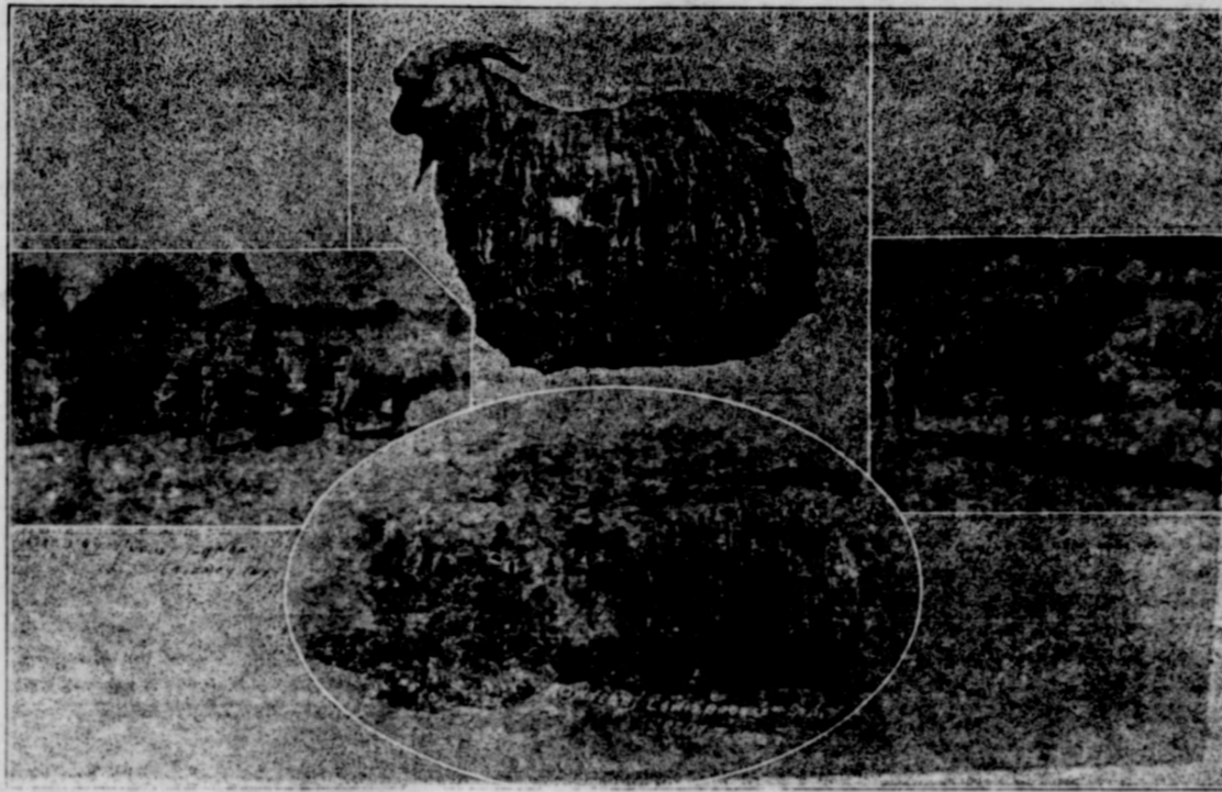
RANCH PRODUCTS—McCULLOCH COUNTY'S FINEST.