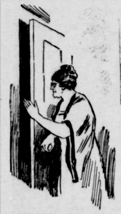
She Tiptoed Softly to Her Son's Room.

"I mean really goodby. I'm sailing for England on Saturday on the Atlantic." "Indeed! My son will be your fellow-traveler." Bream Mortimer looked somewhat apprehensive. "You won't tell him that I was the one who spilled the beans?" "I beg your pardon." "You won't wise him up that I threw a spanner into the machinery?" "I do not understand you." "You won't tell him that I crabbed his net—gave the thing away—gummed the game?" "I shall not mention your chivalrous intervention." "Chivalrous?" said Bream Mortimer doubtfully. "I don't know that I'd call it absolutely chivalrous. Of course, all's fair in love and war. Well, I'm glad you're going to keep my share in the business under your hat. It might have been awkward meeting him on board." "You are not likely to meet Eustace on board. He is a very indifferent sailor and spends most of his time in his cabin." "That's good! Saves a lot of awkwardness. I'll say goodby." "You won't have forgotten you," said Bream Mortimer complacently. He did not see how it was possibly possible for anyone to forget his words. She was like a celebrated chessman. The taste lingered.