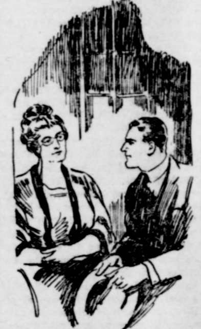
"Letting Windies!" She Spoke as One Might Address a Lunatic.

"Eustace is returning to England on Saturday," said Mrs. Hignett. She spoke a little wistfully. She had not been parted from her son since he had come down from Oxford; and she would have liked to keep him with her till the end of her lecturing tour. That, however, was out of the question. It was imperative that while she was away, he should be at Windies. Nothing would have induced her to leave the place at the mercy of servants who might trample over the flower-beds, scratch the polished floors, and forget to cover up the canary at night. "He sails on the Atlantic." "That's splendid," said Sam. "I'm sailing on the Atlantic myself. I'll go down to the office and see if we can't have a stateroom together. But where is he going to live when he gets to England?" "Where is he going to live? Why, at Windies, of course. Where else?" "But I thought you were letting Windies for the summer?" Mrs. Hignett stared. "Letting Windies!" She spoke as one might address a lunatic. "What