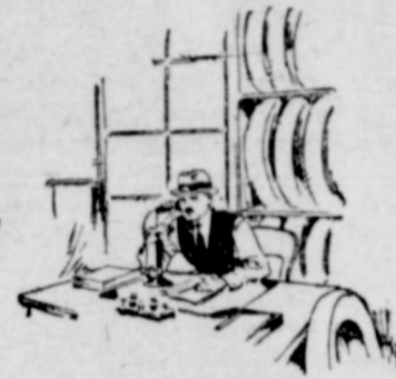
"Here is a man in close touch with one of the 92 U. S. Factory Branches"

of people. The substantial citizen. The man who knows that you can't get something for nothing. The steady customer—not the bargain hunter.