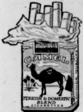
R. J. REYNOLDS Tobacco Co. Winston-Salem, N. C.