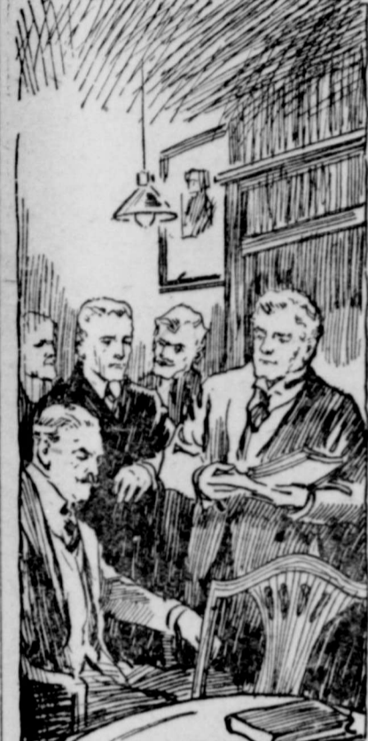
"If Virtue is the Price of a Nation's Life, Let Us Try to Keep Our Own Nation Virtuous."