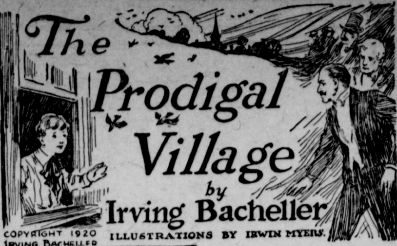
ILLUSTRATIONS BY IRWIN MYERS.

Library Paste. The Standard. Si Proctor has Sisal Binder Tine for sale. Robinson's Daily Reminder—the handiest note book on the market. Extra pads in stock, too. The Brady Standard.