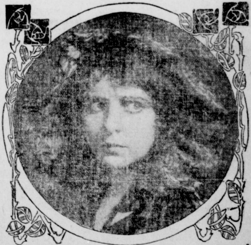
"BEVERLY BAYNE AS 'JULIET' (BUSHMAN = BAYNE 'ROMEO AND JULIET')"