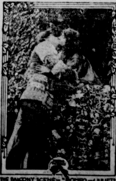
"THE BANCQUY SCENE—'ROMEO AND JULIET'"

Prices 35c. Children 25c. Only One Show, Starting 8:00 P. M.