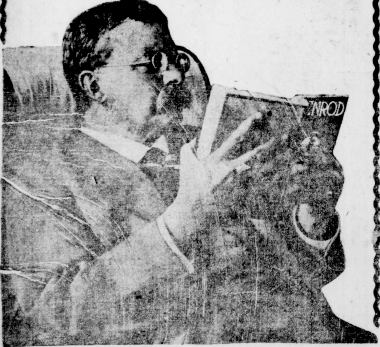
"Penrod," Booth Tarkington's Fascinating Story, So Enthralled Colonel Roosevelt While En Route to Lecture Before the National Geographical Society That He Neglected Science and Politics.

"PENROD" Is the Best Boy Story Since Mark Twain's "Tom Sawyer."