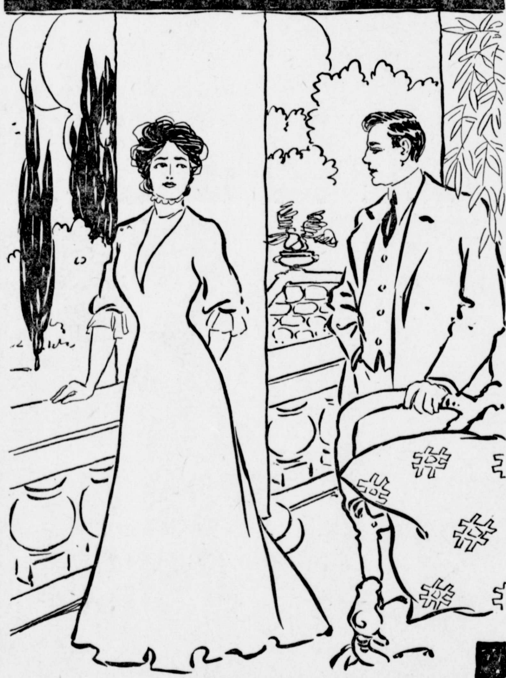
"What Do You Want to Know For?"

Strange to say, Terhune gave no evidence of any inward disquiet or cause for alarm. He showed not the faintest symptoms of a guilty conscience, but laughed and chatted with his customary sociability. If it had not been for his persistent avoidance of conversation with Agatha First I should have been convinced in spite