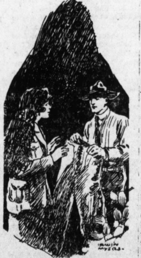
"Senor, Chapparejos and I Are Not Strangers," She Said.

"Same as any of them raider outfits," replied Ladd. "They're across the line for beef. But they'll run off