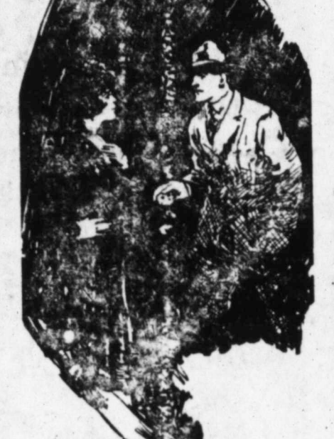
She Stood Erect, Waiting, and, Dark as It Was, He Could Tell She Had Lost the Terror That Had So Shaken Her.

There were five horses—two saddled, two packed and the remaining one carried only a blanket. Ladd short-