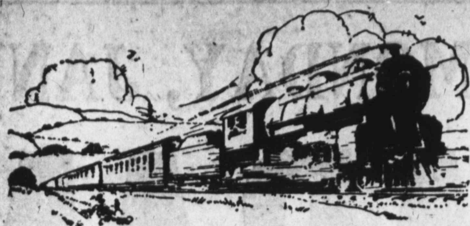
Out of accumulated capital have arisen all the successes of industry and applied science, all the comforts and ameliorations of the common lot. Upon it the world must depend for the process of reconstruction in which all have to share. —JAMES J. HILL