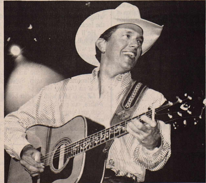
George Strait brought his annual Country Music Festival to the Alamodome Sunday.

The lineup featured the singers of four of the top 10 songs (and six of the top 20) on Billboard's latest country singles chart. Chesney tops the charts with "How Forever Feels," followed by the Dixie Chicks' "You