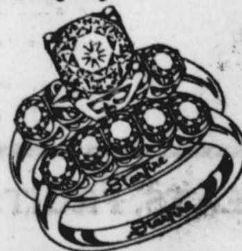
ENGAGEMENT RING Wedding Ring

Rings enlarged to show detail. Prices include Federal Tax.