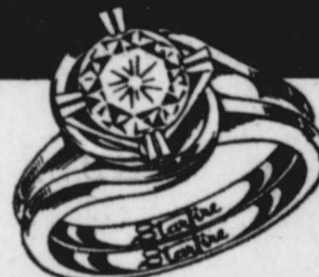
ENGAGEMENT RING Wedding Ring