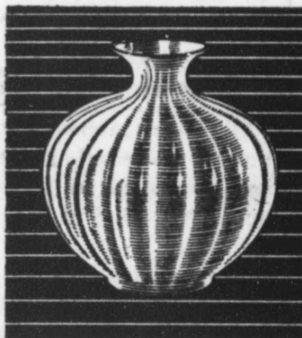
SWEETBRIAR BUD VASE. Gracefully fluted, charmingly versatile. Handcrafted. Height: 4 1/2". 24-k. gold trim...$5.95