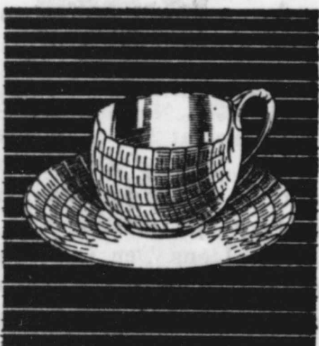
COLLECTOR'S CUP #8. Dainty demitasse. Reproduction of Lenox piece #8. Designed 1889. Limited edition...$7.95