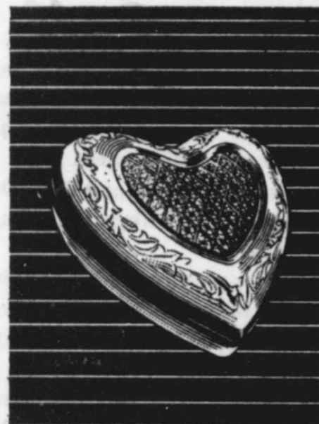
THE HEART BOX. Delightful little box with nostalgic charm. 4" long. 24-k. gold trim...$7.95