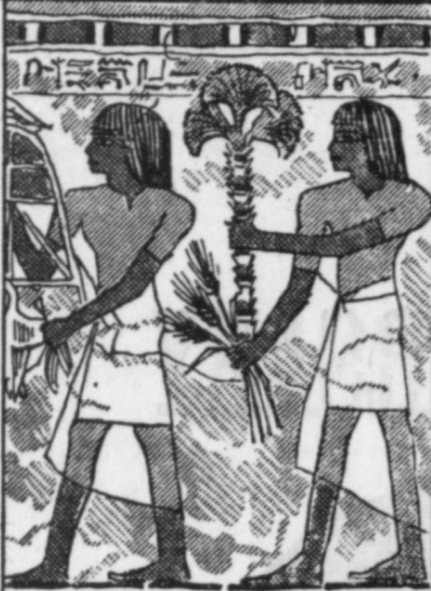
Barley is one of the oldest known grains.

barley production, followed by France, Canada, the United Kingdom, West Germany, and Turkey. North Dakota, California, Montana, Minnesota, and Washington are our top barley producing states.