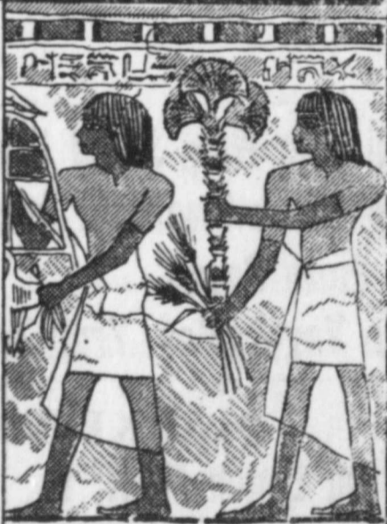
Barley is one of the oldest known grains.

barley production, followed by France, Canada, the United Kingdom, West Germany, and Turkey. North Dakota, California, Montana, Minnesota, and Washington are our top barley producing states.