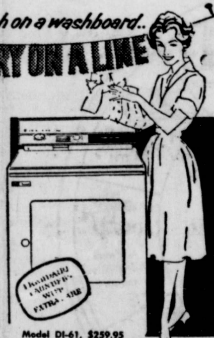
Model DI-61, $259.95 AS LOW AS $7.70 Per Mo.