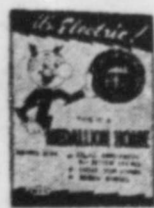
LOOK FOR THIS SIGN ON YOUR NEW HOME

Double check them all, and you'll decide on a Medallion Home.