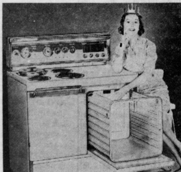
The ovens on electric ranges are easy to clean. The units are easily removed and the porcelain cleans so very, very easily.