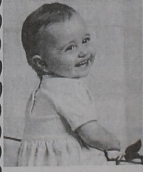
This size $10

Use the handy mail slot in the front door when the office is closed or mail to P.O. Box 490, Post, Texas 79356. call 495-2816 for details