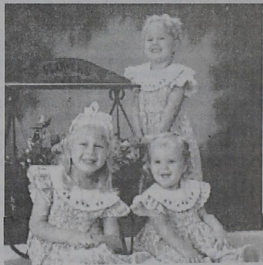
This size (four singles) $40.

Bring your favorite photo of your grandchild to The Post Dispatch before Friday, Feb. 8 for our annual Valentine edition!! Please include names of children and grandparents, with phone number of submitter.