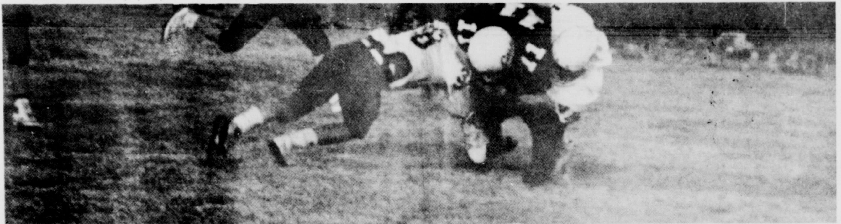
The Gorilla defense creates a 'Cat sandwich