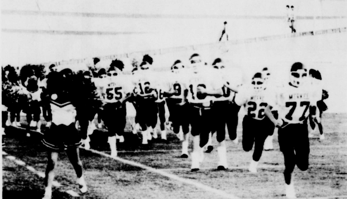
§ The Merkel Badgers take the field as they opened their season in Sweetwater Friday. The Badgers were downed 48-13