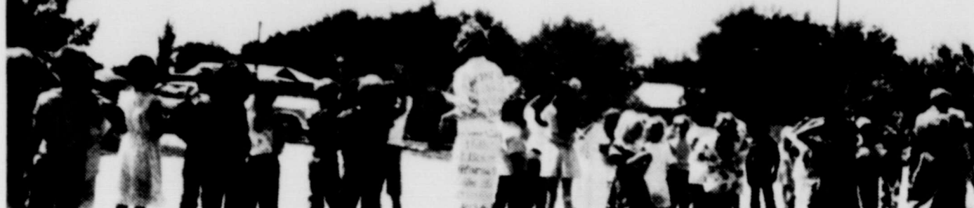
Local school children were excited by a surprise visitor here last week when a blimp promoting a new location of the these park, Sea World, flew by Wednesday.