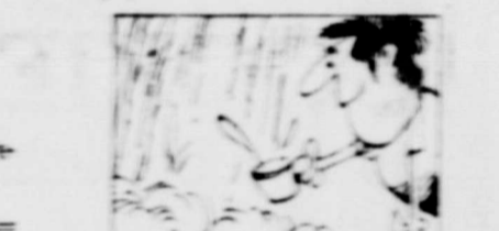
More than 71 million gallons of water pass over Victoria Falls in Africa every minute.

If you need more help or information on this or other consumer problems, contact your nearest Attorney General Consumer Protection Office (in Austin, Dallas, El Paso, Houston, Lubbock, McAllen, and San Antonio). The Attorney General's Office is the people's law firm. We're here to help you.