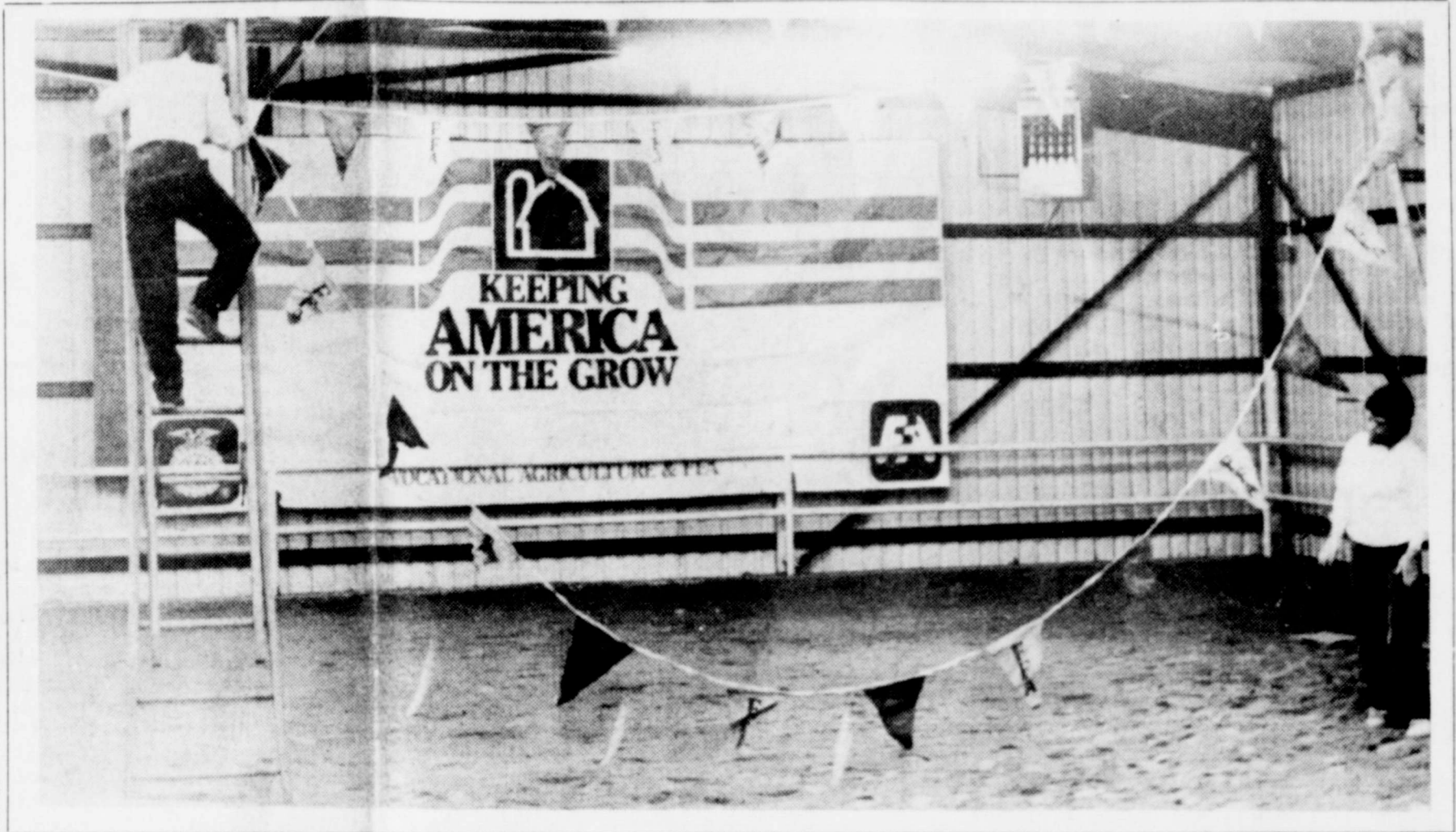
§ The new Merkel FFA Show The Trent FFA Stock Show will Arena is ready to be broken in as also get started at 10 a.m. the annual Merkel Stock Show will get started at 10 a.m. Saturday.