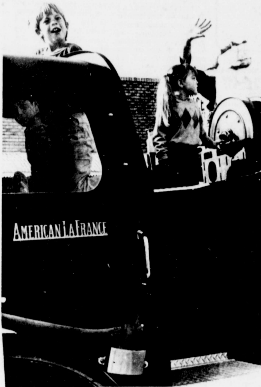
§ The Merkel Volunteer Fire Department gave Santa a break from his sleigh during the Chamber's annual Christmas Parade, held Saturday downtown.