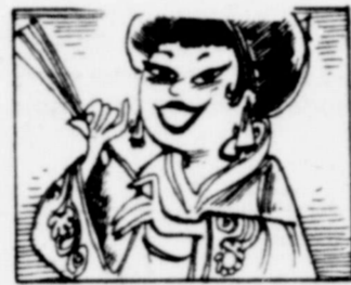
1983 marks the centennial of the invention of artificial silk.

on the vast majority, 71 per cent of the irrigated acres in Texas today, more than 40 per cent of the water is wasted, it's lost to seepage, evaporation or run off. If we converted all of the irrigation systems in the state to the more efficient techniques, we could save more than 900 billion gallons per year. That's more water than every man, woman and child in Texas could drink in 200 years.