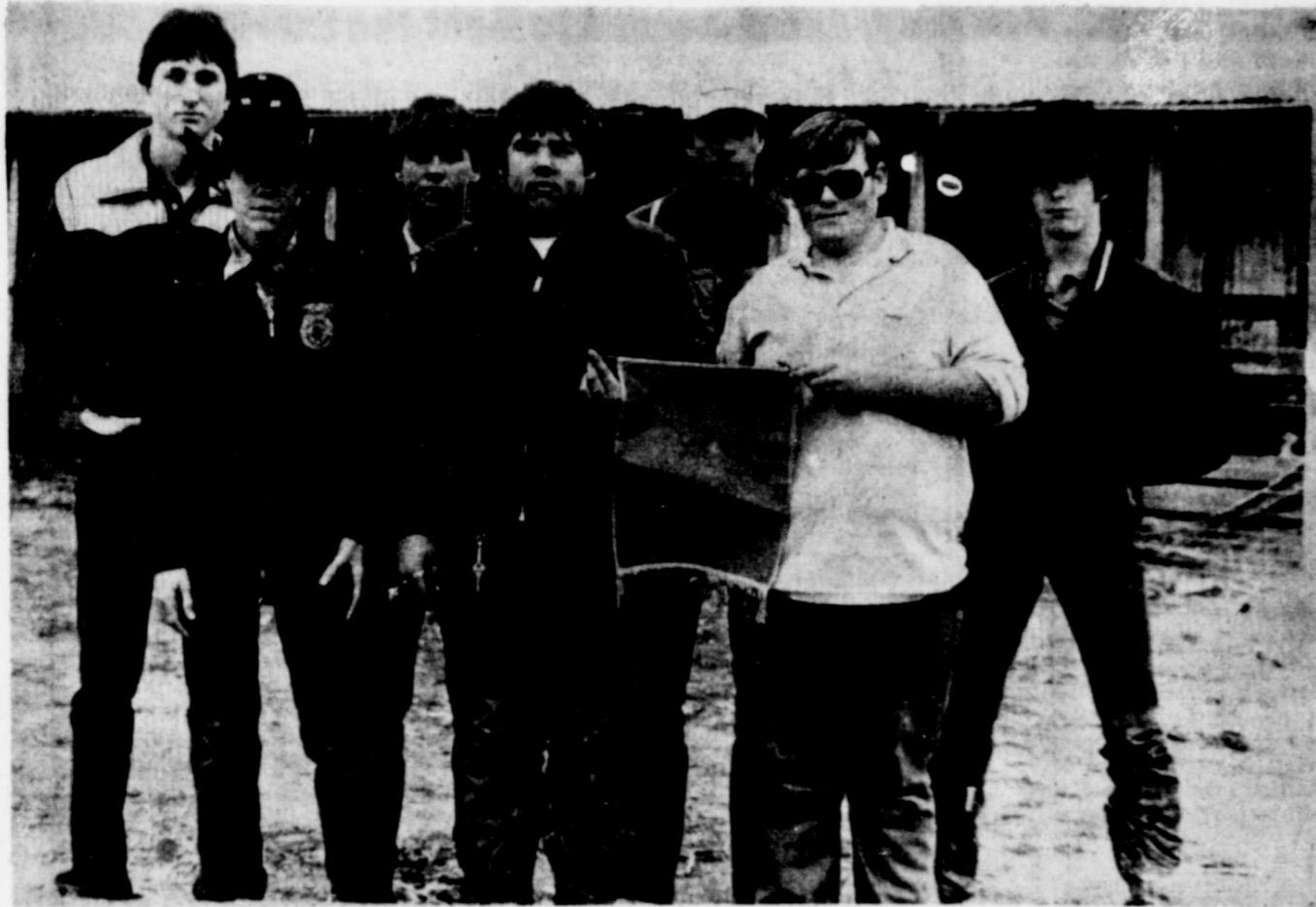
The following team from Merkel and Tren FFA's recently received the Herdsmen's Award at the San Antonio Stock Show. They are (front