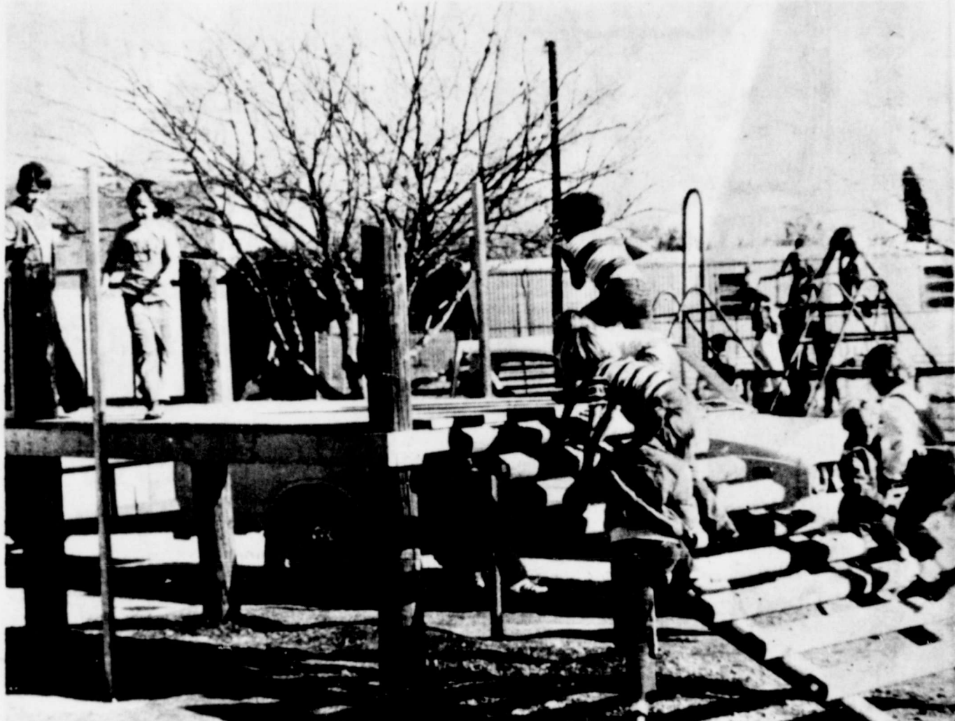
Merkel Elementary students seem to be enjoying their new play fort payed for by Merkel PTO funds and constructed by MISD maintenance employees.