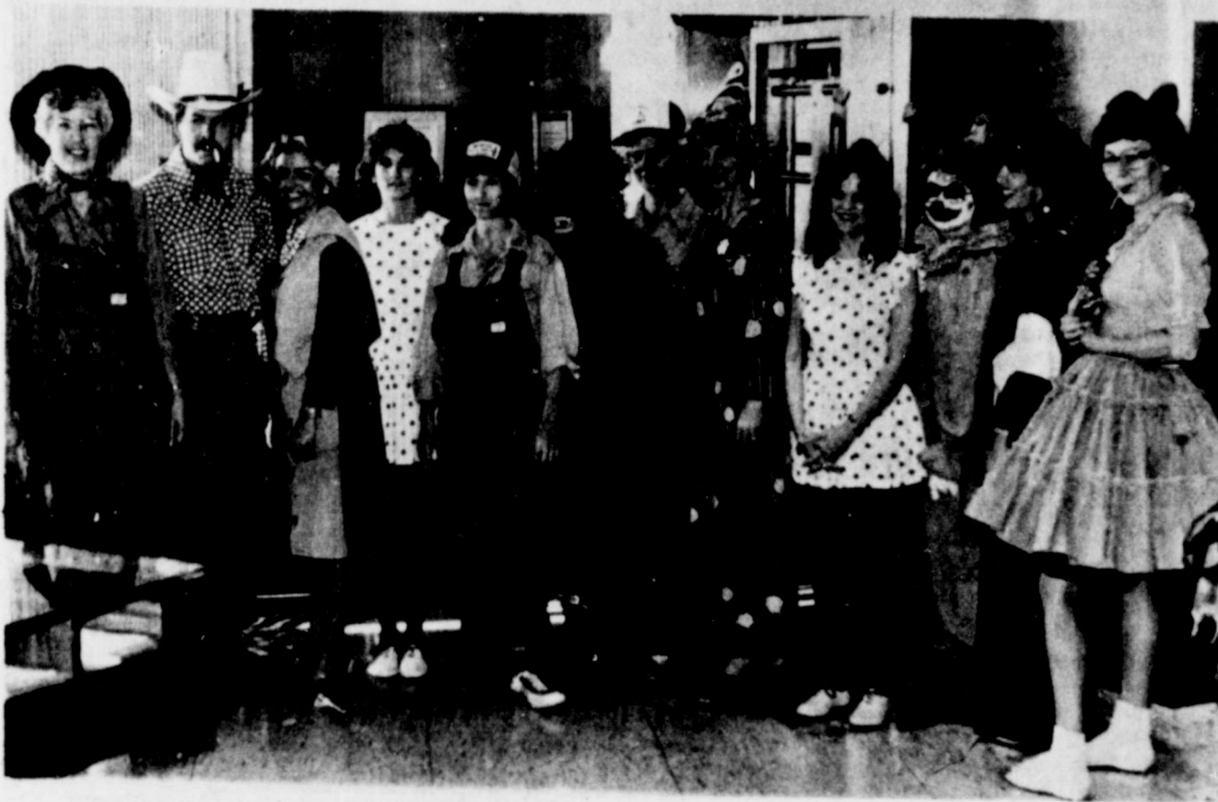
The F&M National Bank staff