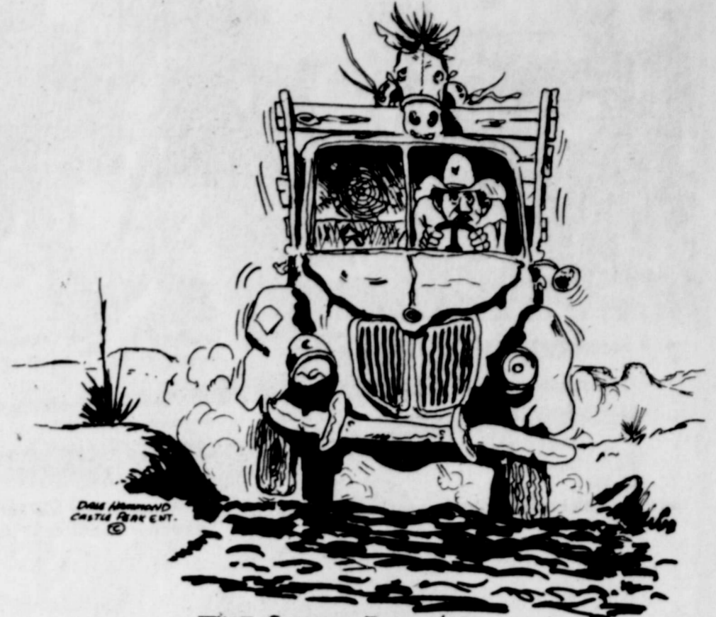
THAT COTTON PICKIN' DUDLEY'S BEEN COMMISSIONER TWO WHOLE DAYS AN' HE AINT FIXED MY ROAD YET!

"Among these options, the choice seems easy enough—economic recovery," says Knutson. "But that recovery may not come fast enough to avoid falling into the economic forces of the third option, that of a reduction of agricultural resources."