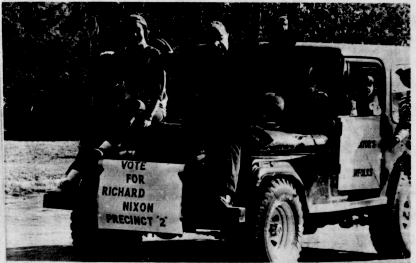
It's not known how many votes Richard Nixon garnered in voting Tuesday, but he campaigned

The Mail would like to congratulate all of the winners in all of the races. We would also like to express our gratitude to all of the challengers that tried and failed for elected office. Without choices on election day, democracy is only a word.