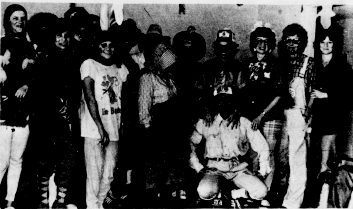
Starr Nursing Home employees