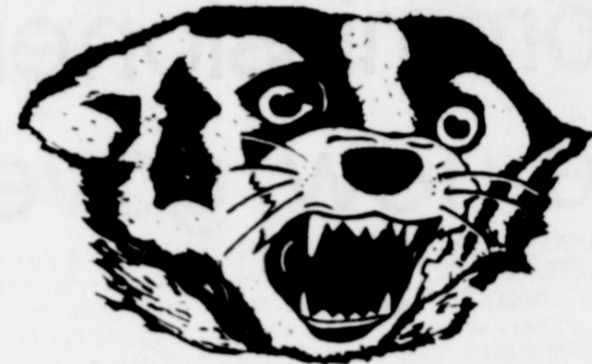
MERKEL HIGH SCHOOL

VARSITY AT STAMFORD FRIDAY AT 8 7th & 8th GRADE AT STAMFORD GAMES START AT 5 THURSDAY