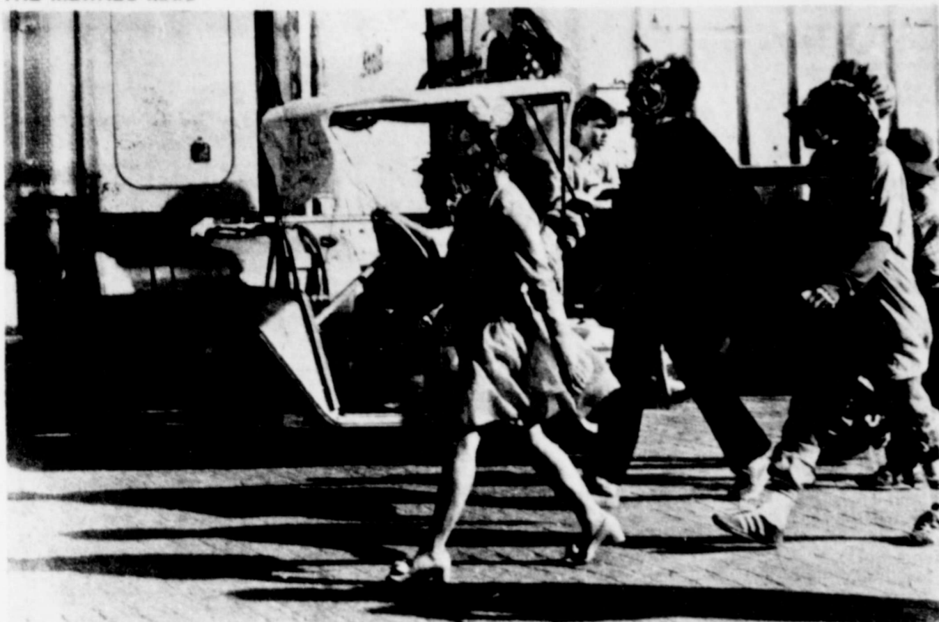
There were all kinds of people wearing all kinds of things at the Merkel Crazy Days Parade held downtown Saturday. [Staff photo]