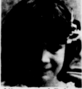
All our good Bakers of the church are busy baking cookies for VBS. Lange