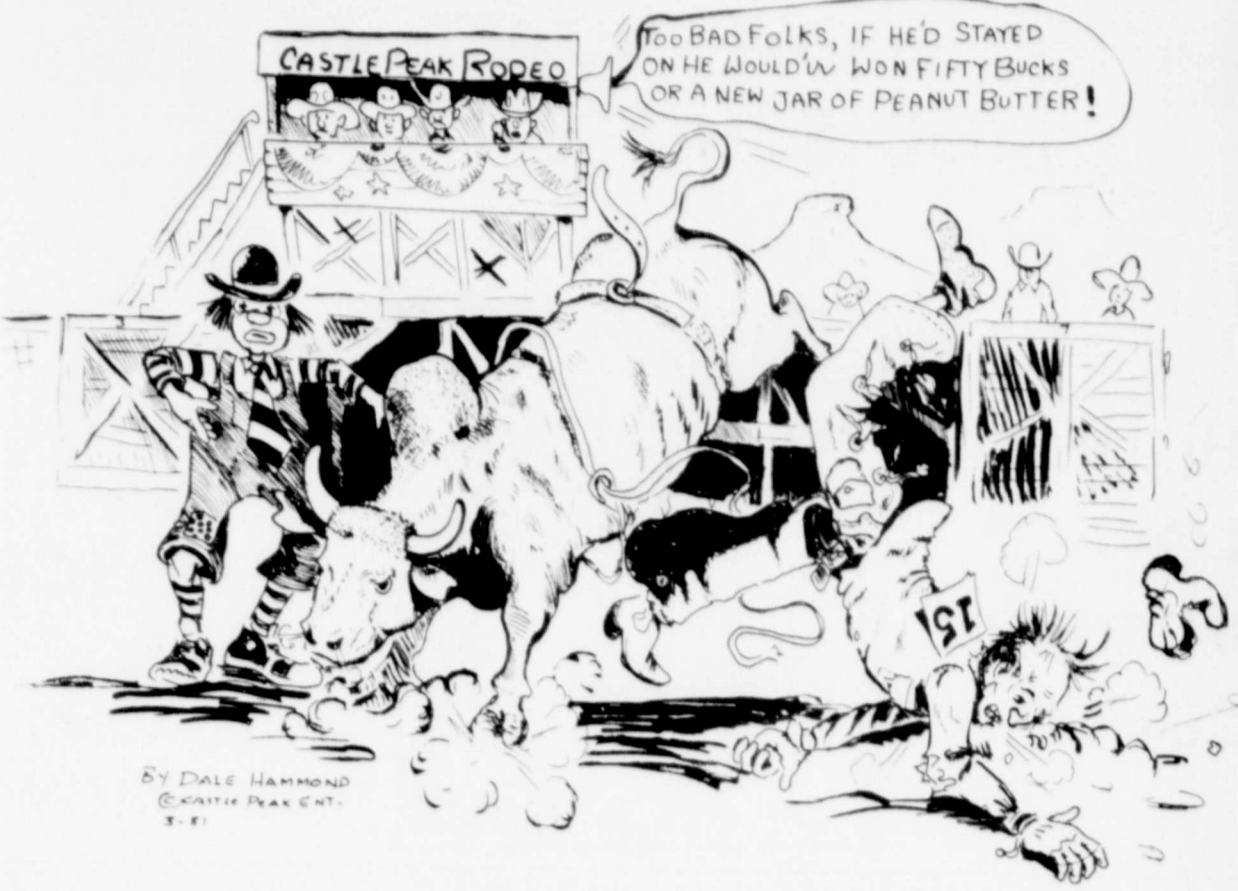
By Dale Hammond © 1981 Castle Peak Ent.