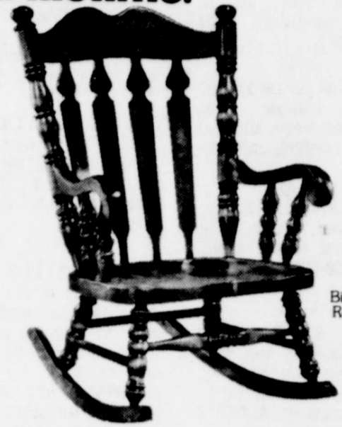
Big Boy Rocker

Be careful when you choose a Tell City Rocker. You'll have it a lifetime.