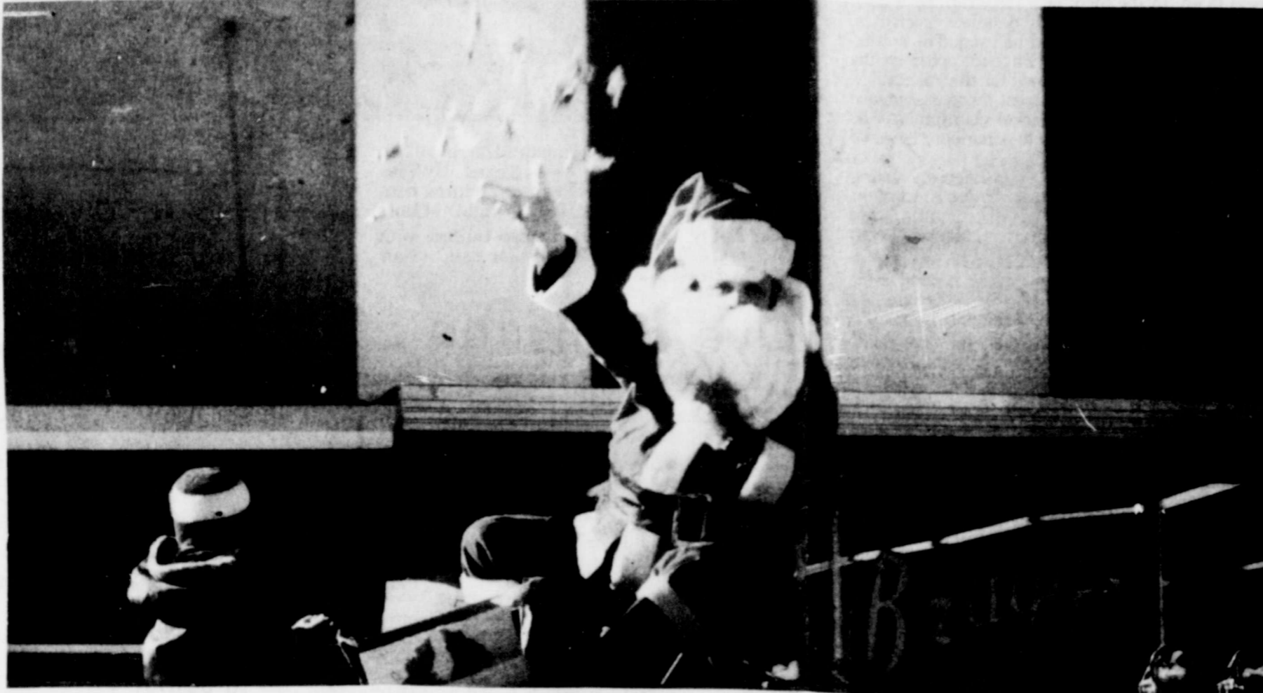
Santa will be in town Saturday at 10:30 for the Christmas parade