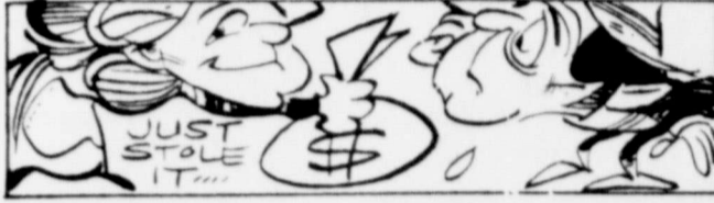
In the 1800's a man was responsible for criminal acts committed by his wife in his presence.

Special lighting is part of the holiday spirit, so enjoy it. But please remember to install and use it safely and wisely.