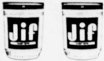
JIF 18oz. $1.15 Each

GET A $1.15 REFUND BY MAIL CERTIFICATES ON OUR DISPLAY