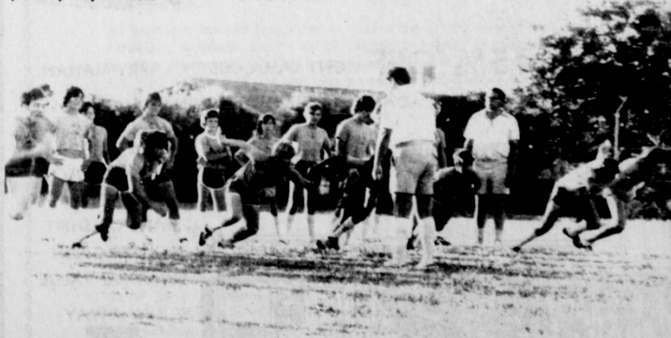
Football practice began Monday for about 35 varsity hopefuls at Merkel High. The Badgers are preparing for their first scrimmage, in Dublin on