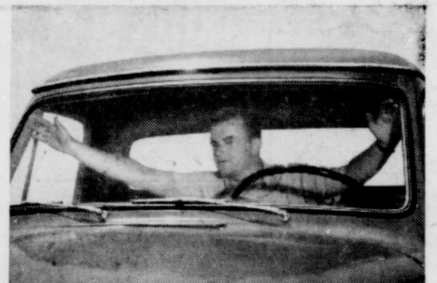
SWEEP your eyes across the new curved one-piece windshield. With picture-window visibility like this you can really navigate. Safer driving, of course! Less eyestrain!