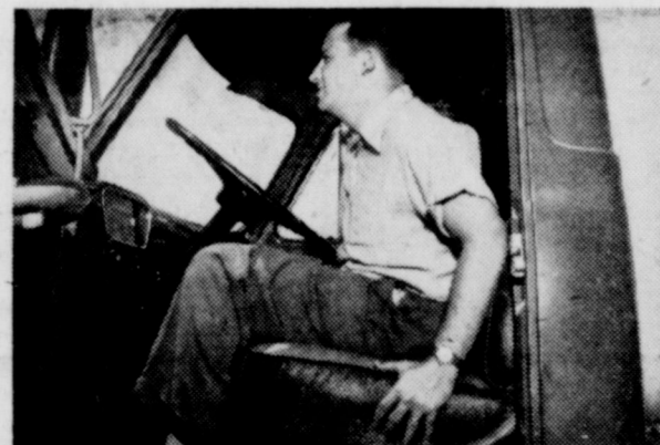
SLIDE into the wide, comfortable seat. Bounce on it to test the super-cushioning action of Ford's exclusive seat shock snubber and new non-sag springs.