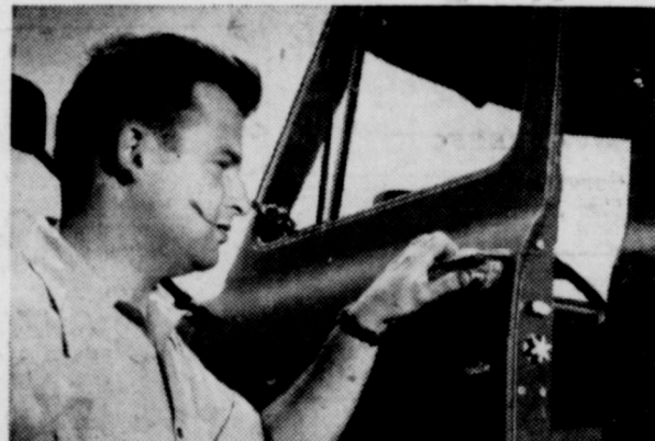
SWING open the new wider doors! Door handles are the easy-operating, push-button type . . . the kind you get on quality cars. Door latches are new rotor type.

Before you buy any truck . . . make the 15-second SIT DOWN TEST! You can see and feel instantly, how Ford has combined truck ruggedness and performance with the comfort a driver deserves!