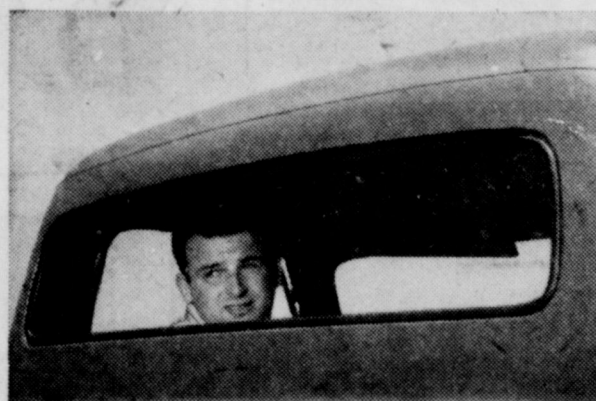
GLANCE back through the 4-ft. rear window. See where you're backing, without leaning. Ford Trucks have more glass area than any of the five other leading truck makes.