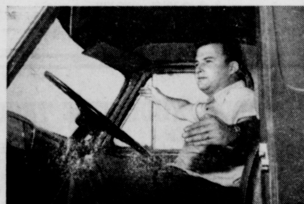
STRETCH your arms into big-cab roominess. Ford's got more hip room than any of the five other leading makes. Man, what a treat this cab is for a working guy!