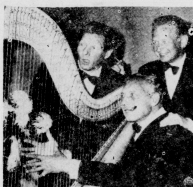
HARMONY—Opera singer Ezio Pinza, seated at harp; UN Secy. Gen. Dag Hammarskjold, right, and comedian Danny Kaye harmonize during United Nations staff day party in General Assembly building.

No rain was predicted in the bureau's current forecast for the Eastland County vicinity. For North Central and West Texas, it'll be generally fair Friday and Saturday. Not much change in temperature.