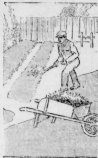
By spreading a mulch once, the gardener saves many hours of cultivating.

heavy rain falling directly on the soil sends up dust which is blown away, to the garden's loss. This is advanced by a government bulletin.