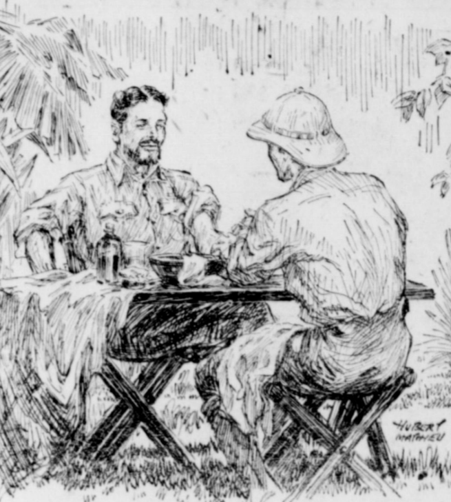
IN A WAY, JESSE LEZEAR ILLUSTRATES HOW A DEMOCRACY SO OFTEN CALLS FORTH THE DEVOTION AND EVEN SELF-SACRIFICE OF ITS CITIZENS. HE IS TYPICAL OF THE MANY AMERICANS, INCLUDING EVEN A NUMBER OF PRISONERS, WHO HAVE FREELY OFFERED THEIR OWN LIVES IN MEDICAL EXPERIMENTS FOR THE COMMON GOOD.

WORKING WITH A MEDICAL RESEARCH TEAM TO FIND A CURE FOR YELLOW FEVER, DR. JESSE LEZEAR, IN 1900, VOLUNTARILY SUBMITTED TO INNOCULATIONS THAT HE KNEW MIGHT KILL HIM—AND, A FEW DAYS LATER, DIED OF THE DISEASE.