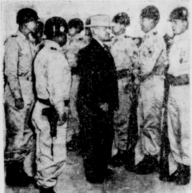
"CAPTAIN" TRUMAN REVIEWS OLD UNIT — Former President Harry S. Truman reviews the honor guard as he arrives at Camp Ripley, Minn., to visit with his old outfit, Battery D of the Missouri 35th Infantry Division, which he commanded as a captain during World War I. The unit is on its annual encampment.