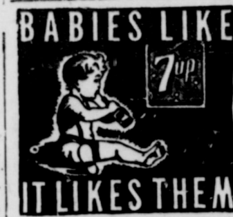
IT LIKES THEM

course, the knot on the fish's jaw was caused by the presence of that high-priced watch. Moreover, the watch's stem had become entangled in the fish's gills so that it was wound each time the fish breathed. It had lost only 10 seconds in 10 years.