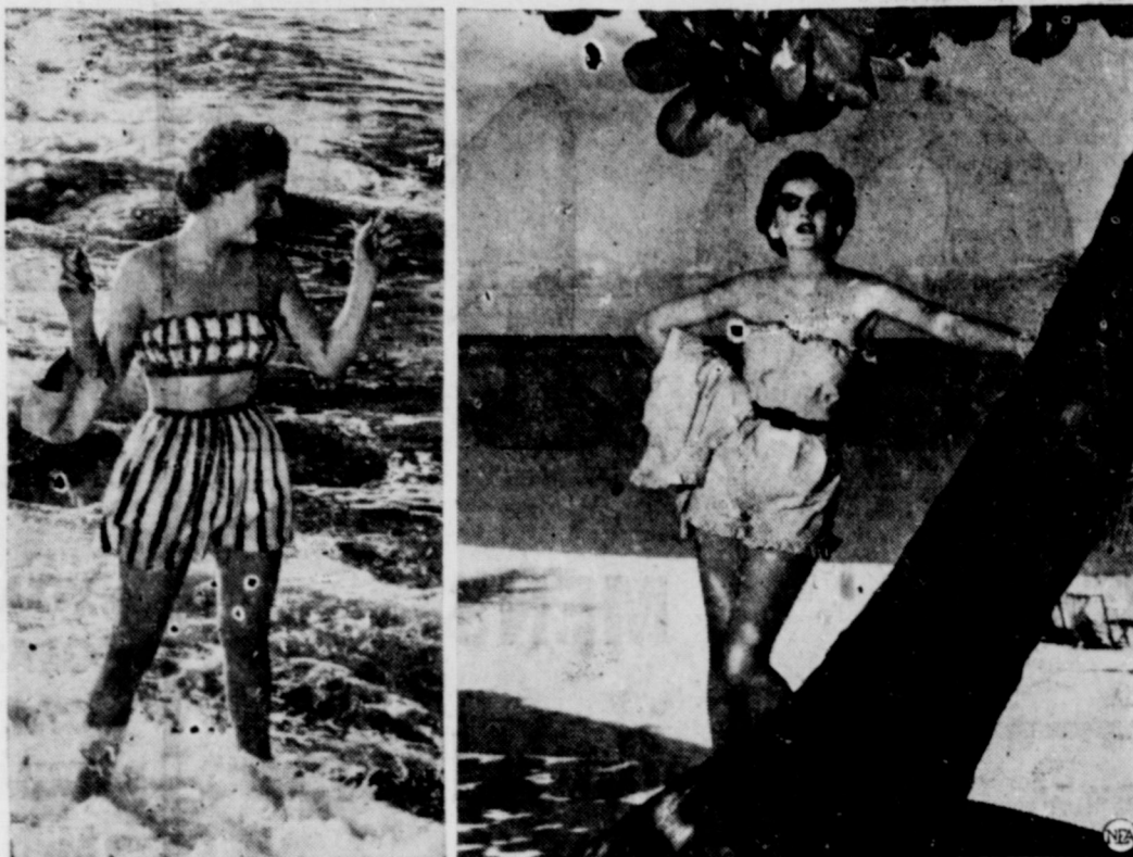
The soft, feminine look in sea fashions is emphasized by Brigrance in a two-piece swim suit (left) in Hope Skillman's delicate lace cotton. This is in black-on-white. Ruffles are back (right) as in this same designer's one-piece swim suit with matching beachcoat. The fabric is wavelength pique. —By Gaile Dugas, NEA Woman's Editor.