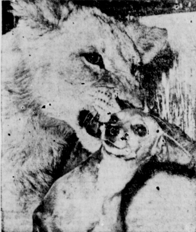
"SHHH—IT'S NO BOLONEY"—"Sultana," catliest gossip of the zoo at Bologna, Italy, gives the zoo's doggy mascot an earful of gossip that's as spicy as the famed Bologna sausage. Probably something chimpily awful about monkeyshines in the baboon's cage.