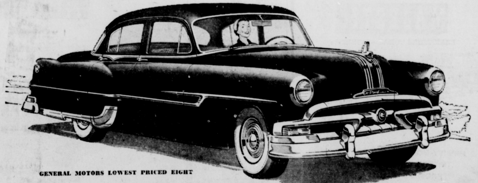
GENERAL MOTORS LOWEST PRICED EIGHT