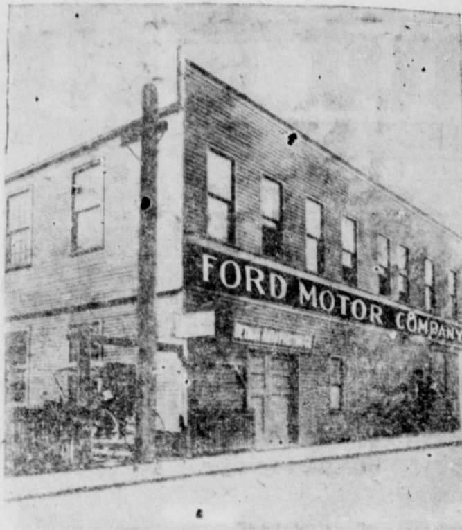
During its first two years, Ford Motor Company assembled approximately 3,500 cars in this rented building on Detroit's Mack Avenue. Ford's 19 U. S. assembly plants, 50 years later built almost twice that number of autos each working day.