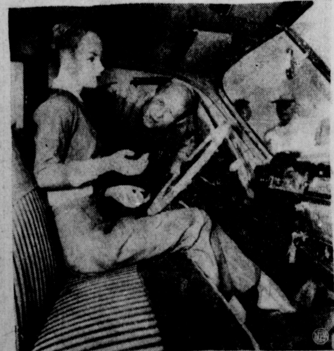
NOT INJURED—Gov. Val Peterson, Administrator of Federal Civilian Defense, checks one of the dummies stationed in a test car near the atomic test site at Yucca Flat. The car, a Cadillac, had its roof caved in but the dummy was not "injured," the roof missing "her" head by a scant margin.

HEADS UP! Here comes the New Rocket OSBORNE MOTOR COMPANY Eastland, Texas