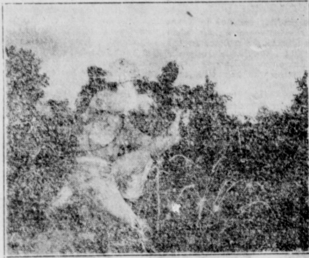
SHOOTING IN THE DARK is simplified with the Army's unpermeable—shown here in daylight—when used infra-red rays to penetrate dark shadows or pitch blackness on the Korean battlefield.

REAL ART GIFT and NOVELTY SHOP 420 Eastland Bank Bldg. Phone 841