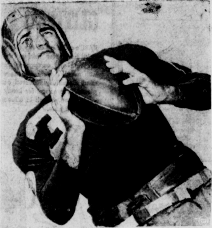
SLINGIN' SAMMY IN ACTION—Modern football's immortal Samuel Adrian Baugh, TCU grid great and long-time pro star with the Washington Redskins, poised to pitch one of his famous TD passes. A left, Sammy, Rotan ranchman and associate coach at Hardin-Simmons, is right at home in cowpoke garb—and can handle a shooting iron as handily as a pigskin.