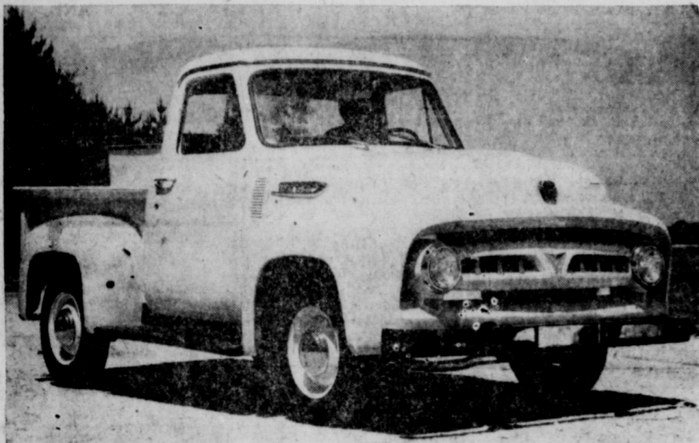
Available with fully automatic Fordomatic transmission for the first time, this new 1953 Ford F-100 Series of pick-up and panel delivery trucks meets nearly 50 percent of all hauling needs. It also is available with four other transmissions including automatic overdrive. The F-100 features an entirely new "driverized" cab termed "the roomiest, most comfortable truck cab on the road"; a new one-piece, curved windshield and a 4-foot wide rear window.

Real Estate and Rentals MRS. M. P. HERRING 1002 S. Seaman Phone 726-W