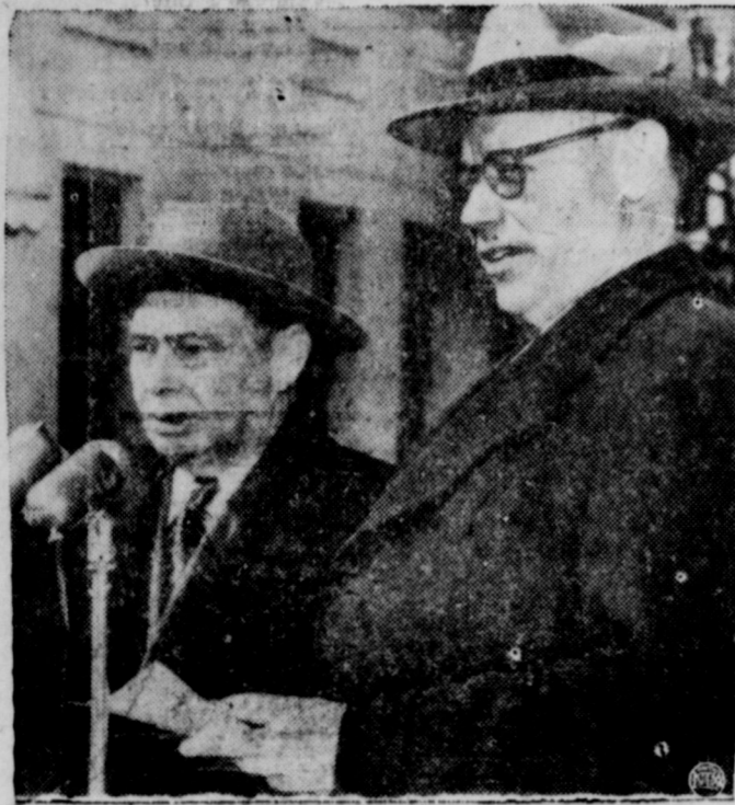
ABANDON EFFORTS —Emerging from a conference with President Eisenhower Monday, Speaker of the House Joseph Martin, left, and Senate Majority leader Robert Taft announced to newsmen the administration's decision to abandon efforts to recommend changes in the Taft-Hartley labor law until after Congressional hearings are held on the subject.