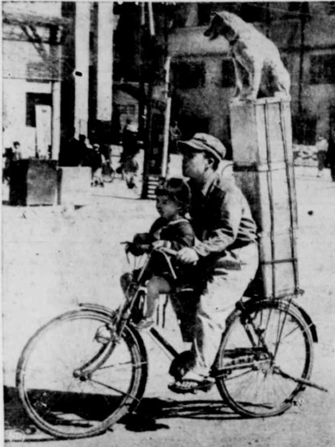
TALL-PERCH POOCH—A Tokyo cyclist pedals his two passengers—a little girl and his pet dog—with little regard for staring eyes. The youngster rides as many children do, but the pooch, has a special "box" seat.