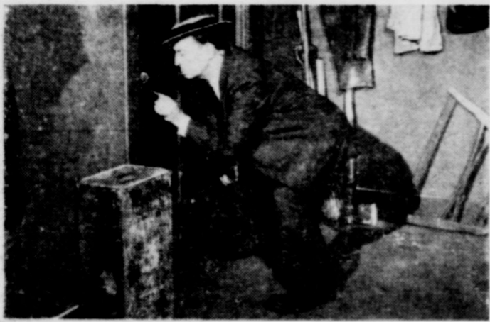
If there is one key Buster Keaton owns, it's the key to an audience's sense of humor. This is a scene from "Exquisite Buster," John Deere Day feature picture.