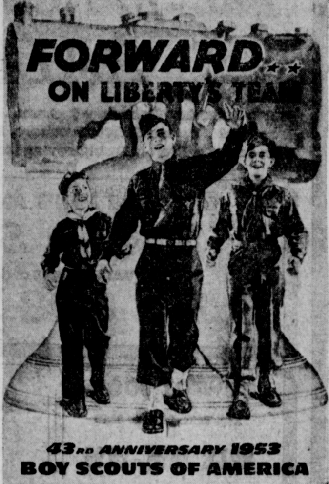
Official Boy Scout Week Poster

Boy Scout Week, Feb. 7 to 13, marking the 43rd anniversary of the Boy Scouts of America, will be observed throughout the nation by more than 3,250,000 boys and adult leaders. Since 1910, more than 20,000,000 boys and men have been members.